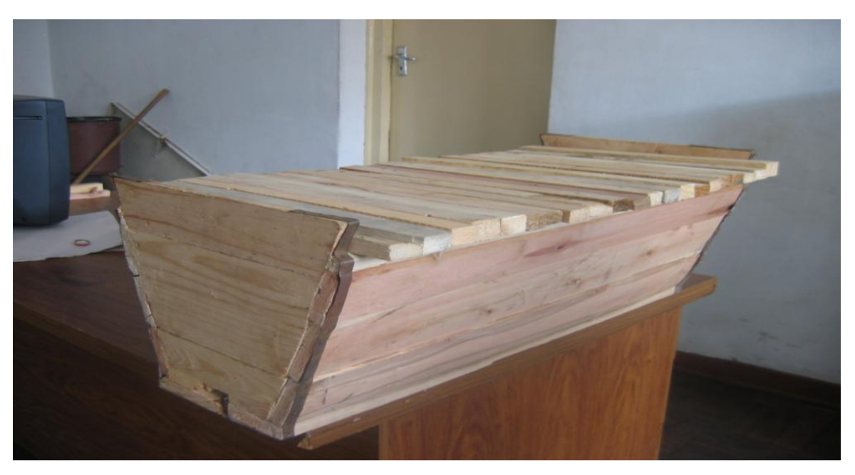
Fig. 1: The Kenya Top Bar hives (KTB)