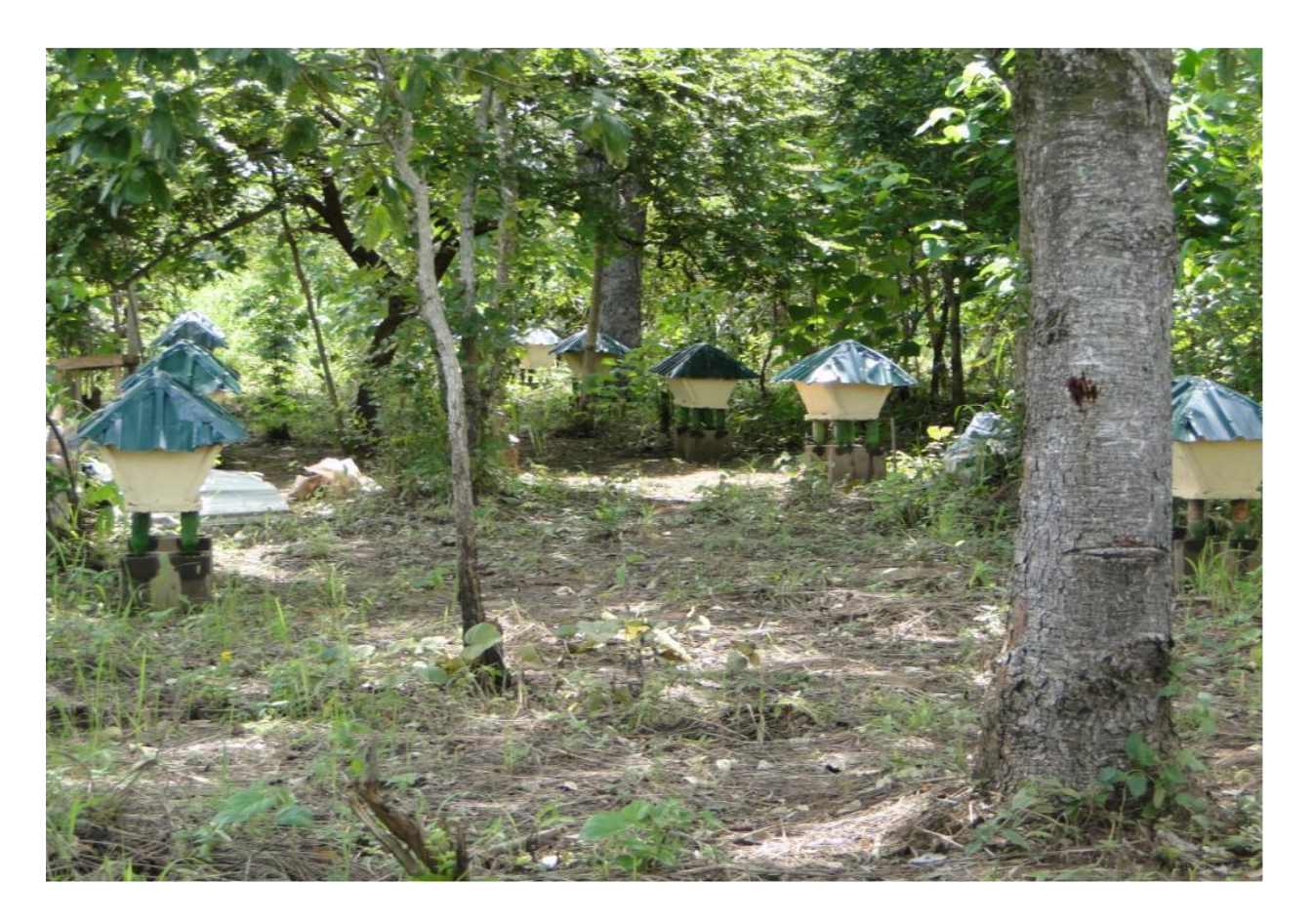
Figure 2: A typical KTB hives in a farm (Source: Onwubuya et al. (2013).

from the super(s) during harvesting. The movable frames fitted in the super and brood chambers are designed to allow standardized comb building and the availability of bee space between the combs. Wax foundations for the Langstroth frames are fitted to the frames, to the bees they appear as unfinished combs and hence would encourage the bees to finish them off-thereby encouraging productivity (BKAZ, 2013).